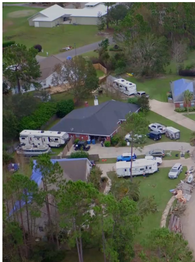
Real-world example of a FORTIFIED home after Hurricane Sally with no damage, while neighbors have roof and water intrusion damage.